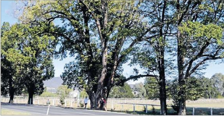
Australia's biggest elm, with a circumference of 6.22 metres and a height of 26 metres. 150416/ELM

As the register has grown, he said it has become increasingly challenging to find trees that would break his existing records, but he could still see promising trees around the Mudgee area, particularly on the drive through Bylong to Muswellbrook.